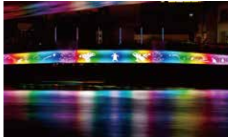
A2 [Fureai Bridge (side of bridge)]

"SORA to MIZU" is located in Ryogoku Bridges. It catches signals such as changes in temperature, sounds in the town, vibrations of the bridge due to cars passing through, and cosmic rays coming from the space. These things are translated into colors, and then, the bridge is covered with the colors. The light, which seems to symbolize the breath of nature and various aspects of the town, is cast around the bridge and onto the water surface.