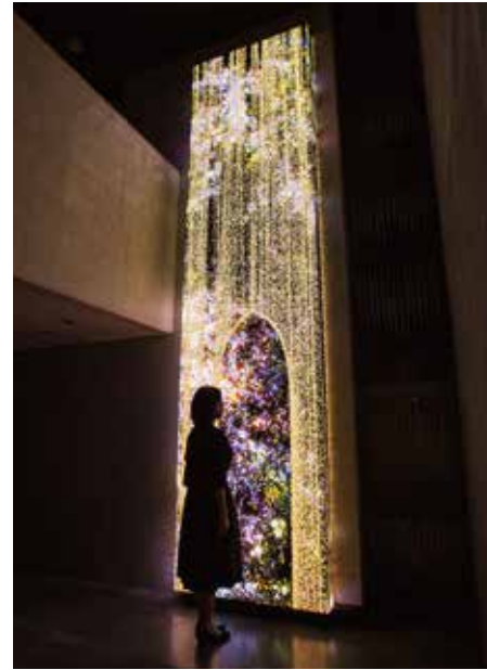
B1 [Shinmachi River Area]

The concept of this work is the history of indigo dyeing that infuses the Shinmachi River. The cascading indigo lights make for a brilliant vision in the peaceful surrounding city night.