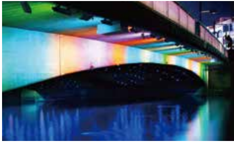
A1 [Ryogoku Bridge]