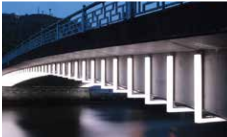
A3 [Shinmachi Bridge]

This artwork represents Awa folk tales of raccoon drawn in white LED light in the back of rainbow colors. On the west side of the bridge, two scenes from the stories, in which raccoons show their gratitude to the people who spare them their lives, starting from the both edges. In the center where the scenes meet, it is a "raccoon" that is standing -it is a symbol of luck and happiness and bridges between a dream and the real world. On the east side of the bridge, a shaman blesses the "raccoon", playing music, stamps the ground, and dances.