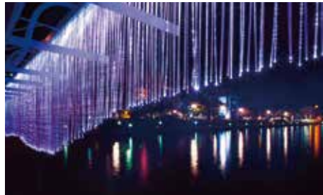
A4 [Kasuga Bridge]

The lines of white light in rows play with rhythm of different patterns and create slow, majestic music. The work uses only white color for light, as "white" includes, embraces, and resembles all colors. It is dedicated to the people of Tokushima.