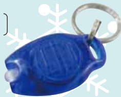
*Representative image only

Visit each of the points and collect the stamps. The 100 drawing winners will receive commemorative Tokushima LED Digital Art Festival goods.